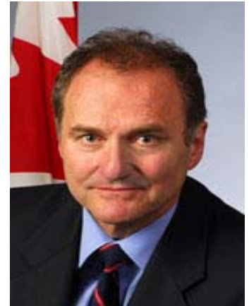
Senator Joseph Day (New Brunswick)

Senator Day currently sits on the Banking, Trade and Commerce Committee; National Security and Defence Committee, the Subcommittee on Veterans Affairs, and is the chair of the National Finance Committee.