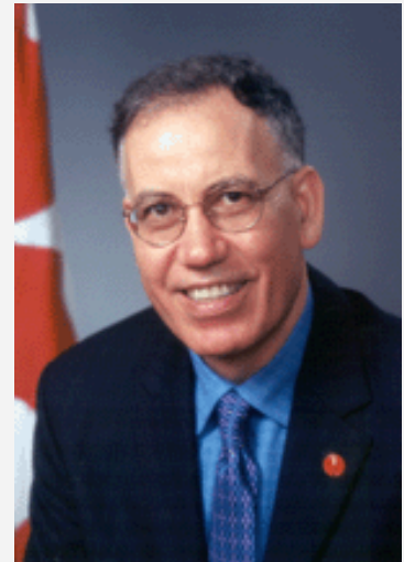
Senator Mac Harb (Ontario)

Senator Harb has spoken out on international issues ranging from bilateral trade relations with developing countries to the protection of human rights in Burma and the celebration of the contribution of engineers to Canada and the world. In a motion and through A Private Member's Bill to amend the Non-Smokers' Health Act , Senator Harb called on the Federal government and its provincial counterparts to ensure that Canada's workplaces and public places are smoke-free. He has tabled legislation calling for the establishment of the National Registry for Medical Devices to protect Canadians who depend on medical devices in their day-to-day lives.