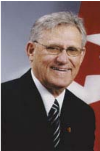
Senator Robert Peterson (Saskatchewan)