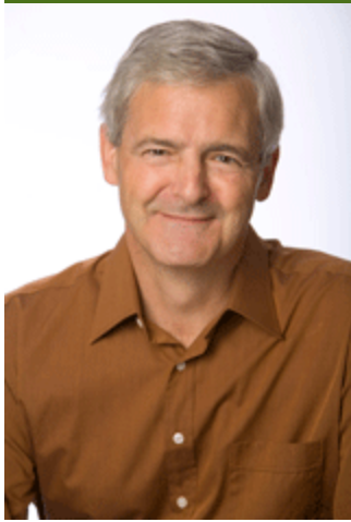
Marc Garneau, M.P. Westmount – Ville Marie