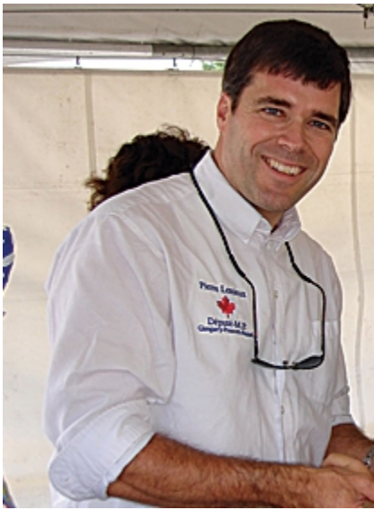
Pierre Lemieux, M.P.

In October 2007, the Prime Minister chose Pierre to be both the parliamentary secretary for Official Languages and the deputy whip for the Government.